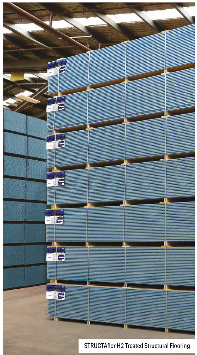
STRUCTAflor H2 Treated Structural Flooring